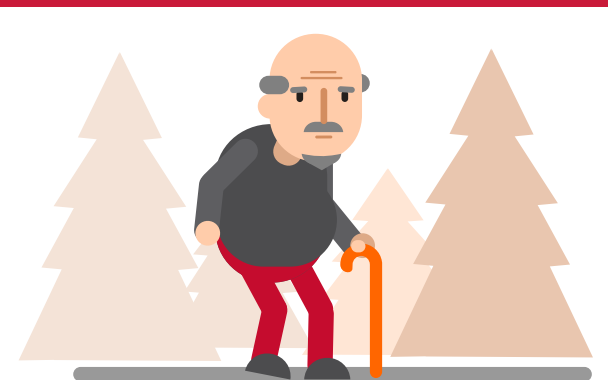
Muscle stiffness, difficulty in getting started to move, and difficulty walking