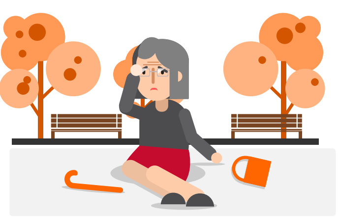
Mental disturbance, falling

Lewy bodies disease resemble sypmptoms which are fairly similar to Parkinson's disease and also has many noticeable similarities with Alzheimer's disease. Memory problems normally develop only when the disease progresses. There is no preventive, curing, or halting treatment for the disease. Taking care of health, symptomatic medications, active and steady lifestyle support a patient's everyday life.